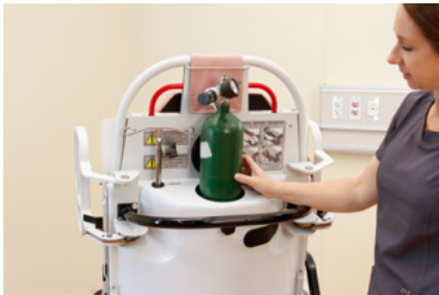
O 2 Tank Holder